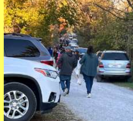
FW Chapter Lane to Chapterhouse