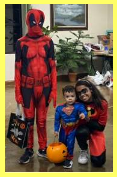
We can't wait to do it all again next year!